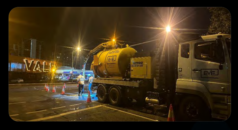
PUP utility investigation – Blackspots program, Breakfast Creek