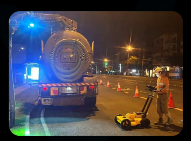
GPR scanning and potholing for PUP investigation