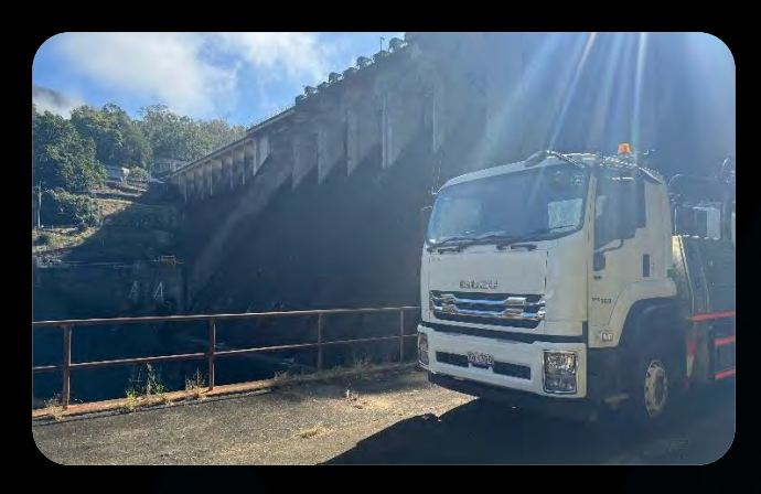
Somerset Dam - GPR scanning and drill mud excavation