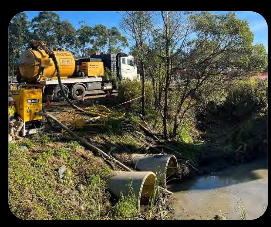
Confined space culvert cleaning and vacuum loading